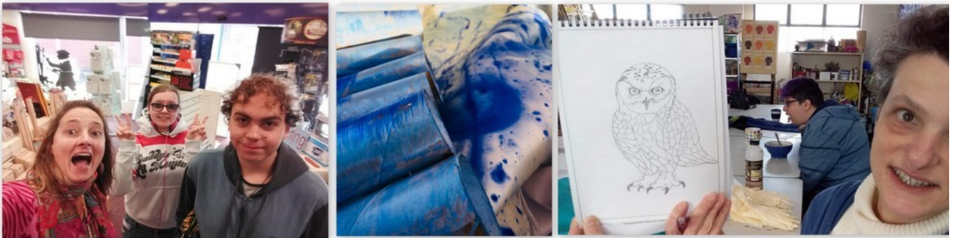
Studio Action At Philcams, Kim's Remade materials, Rita's Owl